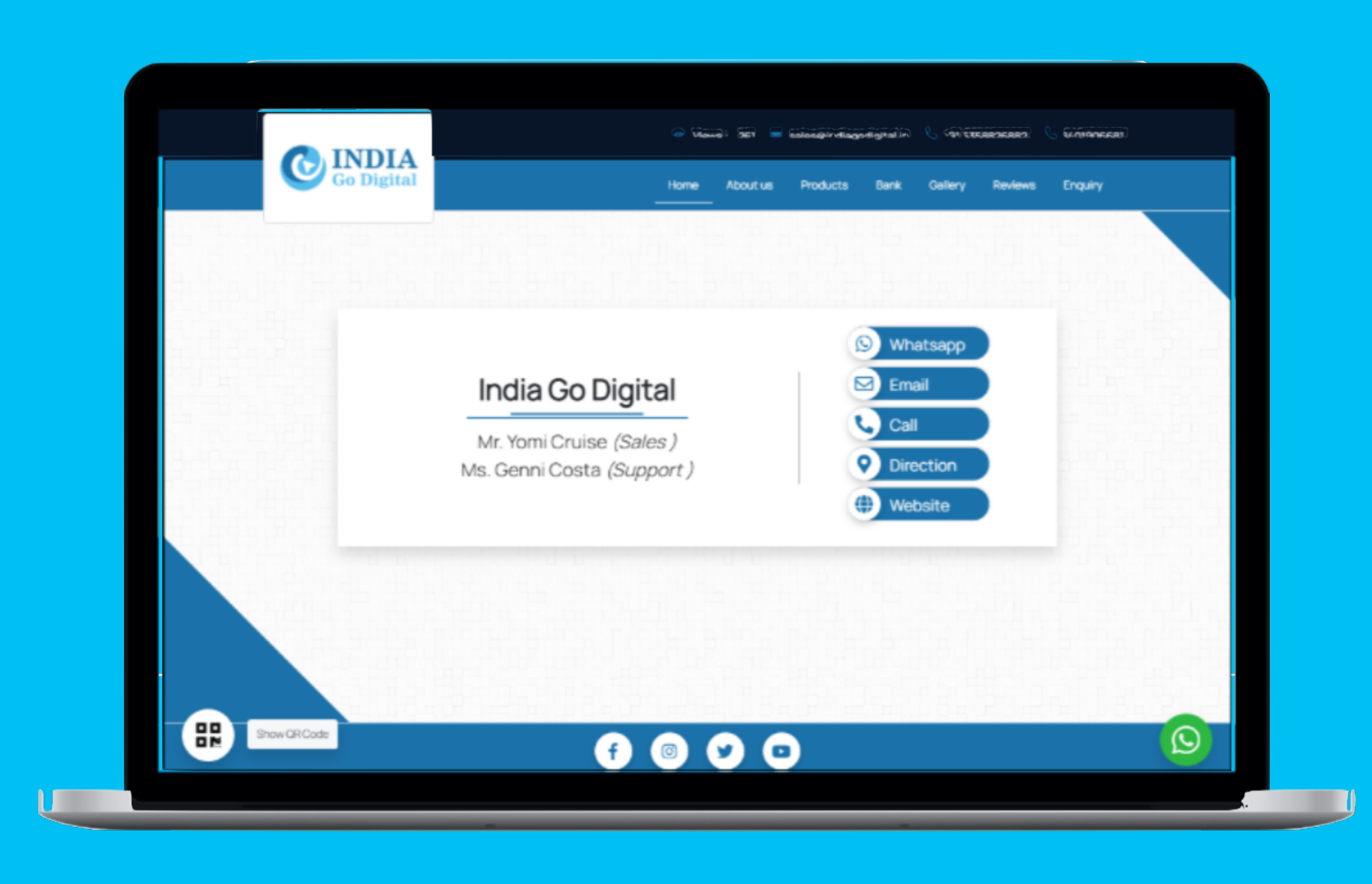
Digital card + Mobile View